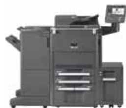
Shown with standard 270 sheet DSDP, optional 3,000 sheet side LCT and 4,000 sheet finisher