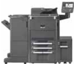
Shown with standard 270 sheet DSDP, optional 3,000 sheet side LCT and 4,000 sheet finisher