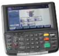
Newly designed, easy-to-use large color touch screen control panel