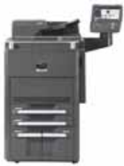
Shown with standard 270 sheet DSDP