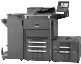
Shown with standard 270 sheet DSDP, optional 1,500 x 2 sheet trays, 500 sheet multi-purpose tray and 4,000 sheet finisher