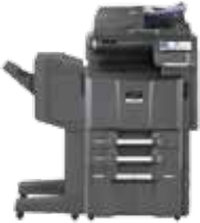
Shown with optional 175 sheet DSDP, optional 1,500 x 2 sheet trays, and 1,000 sheet finisher