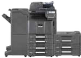
Shown with optional 175 sheet DSDP, 2 - 500 x 2 sheet paper trays, 500 sheet multi-purpose tray, and 4,000 sheet finisher